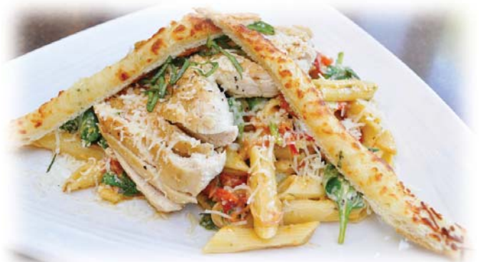
RAMBORGHINI CHICKEN PASTA

Under 500 calories featuring chicken breast & shrimp, pan-sautéed with zucchini, red pepper, green onion and Big Horn Hefy sauce. Served over spinach 12.99