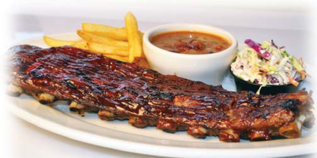
BIG RED BABY BACK RIBS