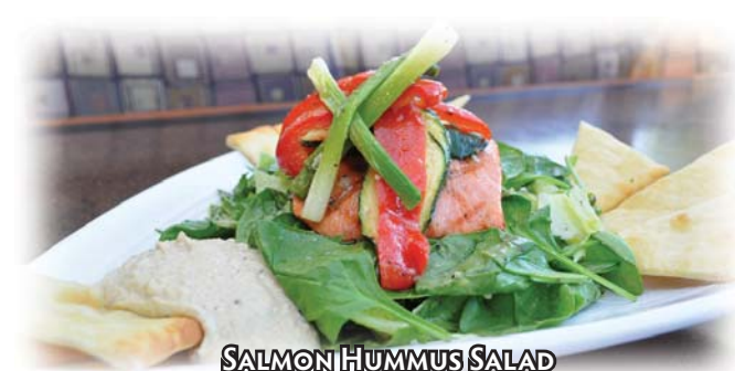
SALMON HUMMUS SALAD

* SALMON HUMMUS SALAD Rosemary-butter grilled Alaska sockeye salmon, served over fresh greens & spinach, tossed with white balsamic vinaigrette. Finished with roasted vegetables, hummus and flat bread 13.99