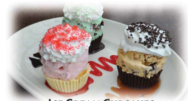
ICE CREAM CUPCAKES 2.99 each or any Three for 6.99

WHITE CHOCOLATE RASPBERRY CHEESECAKE Baked on a chocolate crumb crust 4.99