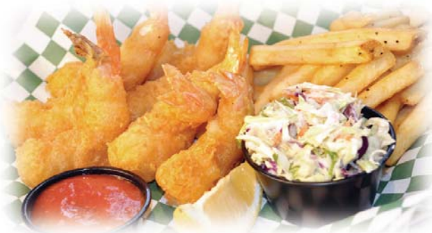
RAM JUMBO BEER BATTER SHRIMP

Locally & Globally Sourced | All Natural & Wild | Sustainable