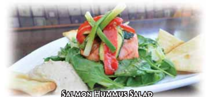
SALMON HUMMUS SALAD

*CHICKEN CAESAR Choice of GRILLED or BLACKENED chicken , romaine, rosemary garlic croutons, caesar dressing and shredded parmesan 11.99 GRILLED or BLACKENED SALMON add $4