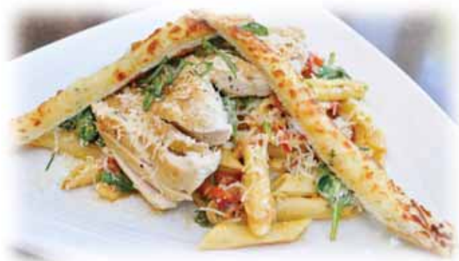
RAMBORGHINI CHICKEN PASTA

RAMBORGHINI *CHICKEN PASTA Penne tossed with pepperoni, red onion, bell pepper, artichoke, spinach with tarragon, sundried tomato pesto 12.99