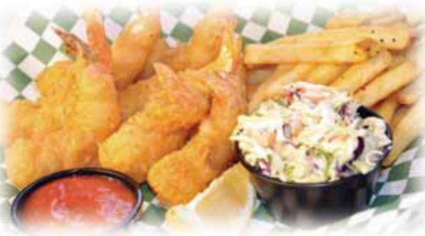
RAM JUMBO BEER BATTER SHRIMP

Locally & Globally Sourced | All Natural & Wild | Sustainable