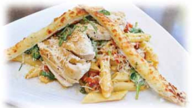
RAMBORGHINI CHICKEN PASTA

RAMBORGHINI CHICKEN PASTA Penne tossed with pepperoni, red onion, bell pepper, artichoke, spinach with tarragon, sundried tomato pesto 12.99