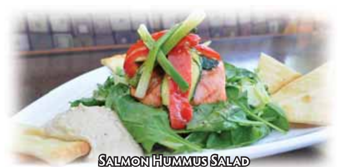
SALMON HUMMUS SALAD

SALMON HUMMUS SALAD Rosemary-butter grilled Alaska sockeye salmon, served over fresh greens & spinach, tossed with white balsamic vinaigrette. Finished with roasted vegetables, hummus and flat bread 13.99