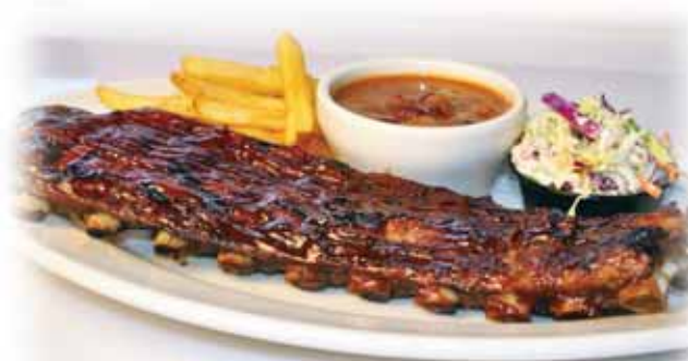
BIG RED BABY BACK RIBS